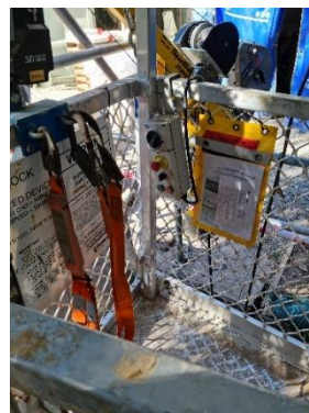
Swing stage (under angled roof) seen from ANZAC Park and up close. Two workers at a time can use this lift to access the tunnel over 60-metres down.